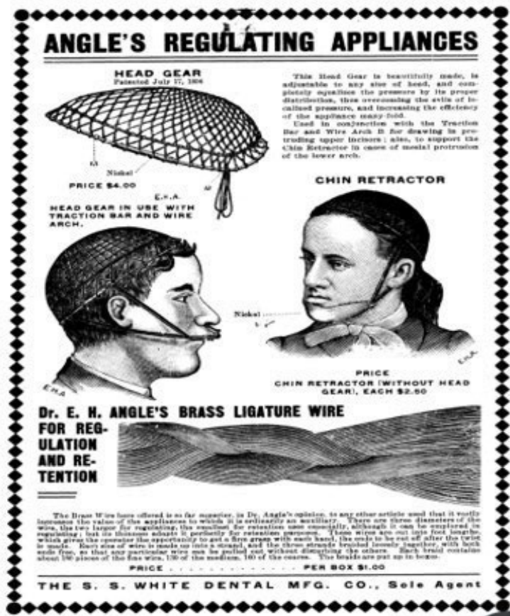
Illustration from Dental Cosmos (1903).

After 119 years, we return to beautiful Asheville in the fall, a color-filled time to experience the wonderful autumn and attend an exciting meeting. The presentations will address issues that concern our state and territory boards.